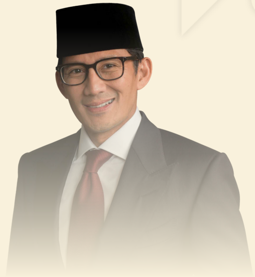
Dr. H. Sandiaga Salahuddin Uno, BBA., MBA.

I appreciate the activities held by ALSA LC Unsri, which are creative, collaborating and continue to explore knowledge, I hope that through this activity, we will continue to share and become a place to run because we are not just waiting for the ball, but we must always remember 3G (gerak cepat, gerak bersama, garap semua potensi online) Therefore, all the knowledge gained can increase the motivation and ability of legal experts towards a golden Indonesia. Always success for ALSA, especially ALSA LC Unsri.