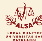
LOCAL CHAPTER UNIVERSITAS SAM RATULANGI