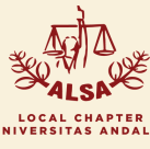
LOCAL CHAPTER UNIVERSITAS ANDALAS