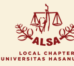
LOCAL CHAPTER UNIVERSITAS HASANUDDIN