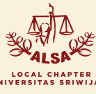
LOCAL CHAPTER UNIVERSITAS SRIWIJAYA