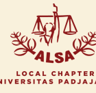
LOCAL CHAPTER UNIVERSITAS PADJAJARAN