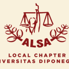
LOCAL CHAPTER UNIVERSITAS DIPONEGORO