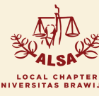
LOCAL CHAPTER UNIVERSITAS BRAWIJAYA