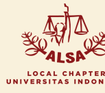
LOCAL CHAPTER UNIVERSITAS INDONESIA