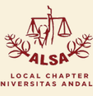
LOCAL CHAPTER UNIVERSITAS ANDALAS