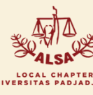
LOCAL CHAPTER UNIVERSITAS PADJADJARAN