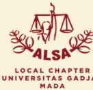
LOCAL CHAPTER UNIVERSITAS GADJAH MADA