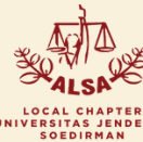
LOCAL CHAPTER UNIVERSITAS JENDERAL SOEDIRMAN