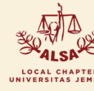
LOCAL CHAPTER UNIVERSITAS JEMBER