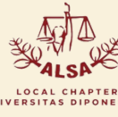
LOCAL CHAPTER UNIVERSITAS DIPONEGORO