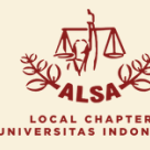
LOCAL CHAPTER UNIVERSITAS INDONESIA