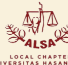
LOCAL CHAPTER UNIVERSITAS HASANUDDIN