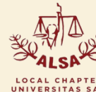
LOCAL CHAPTER UNIVERSITAS SAM RATULANGI