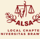
LOCAL CHAPTER UNIVERSITAS BRAWIJAYA