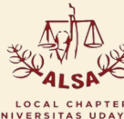
LOCAL CHAPTER UNIVERSITAS UDAYANA