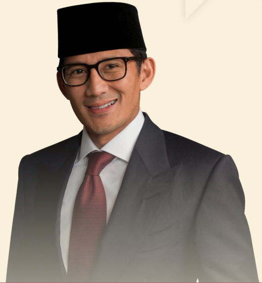
Dr. H. Sandiaga Salahuddin Uno, BBA., MBA. Ministry of Tourism and Creative Economy of the Republic of Indonesia

I appreciate the activities held by ALSA LC Unsri, which are creative, collaborating and continue to explore knowledge, I hope that through this activity, we will continue to share and become a place to run because we are not just waiting for the ball, but we must always remember 3G ( gerak cepat, gerak bersama, garap semua potensi online ) Therefore, all the knowledge gained can increase the motivation and ability of legal experts towards a golden Indonesia. Always success for ALSA, especially ALSA LC Unsri.